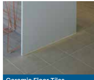
Ceramic Floor Tiles