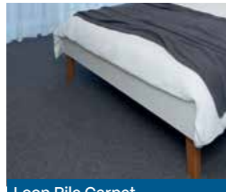
Loop Pile Carpet