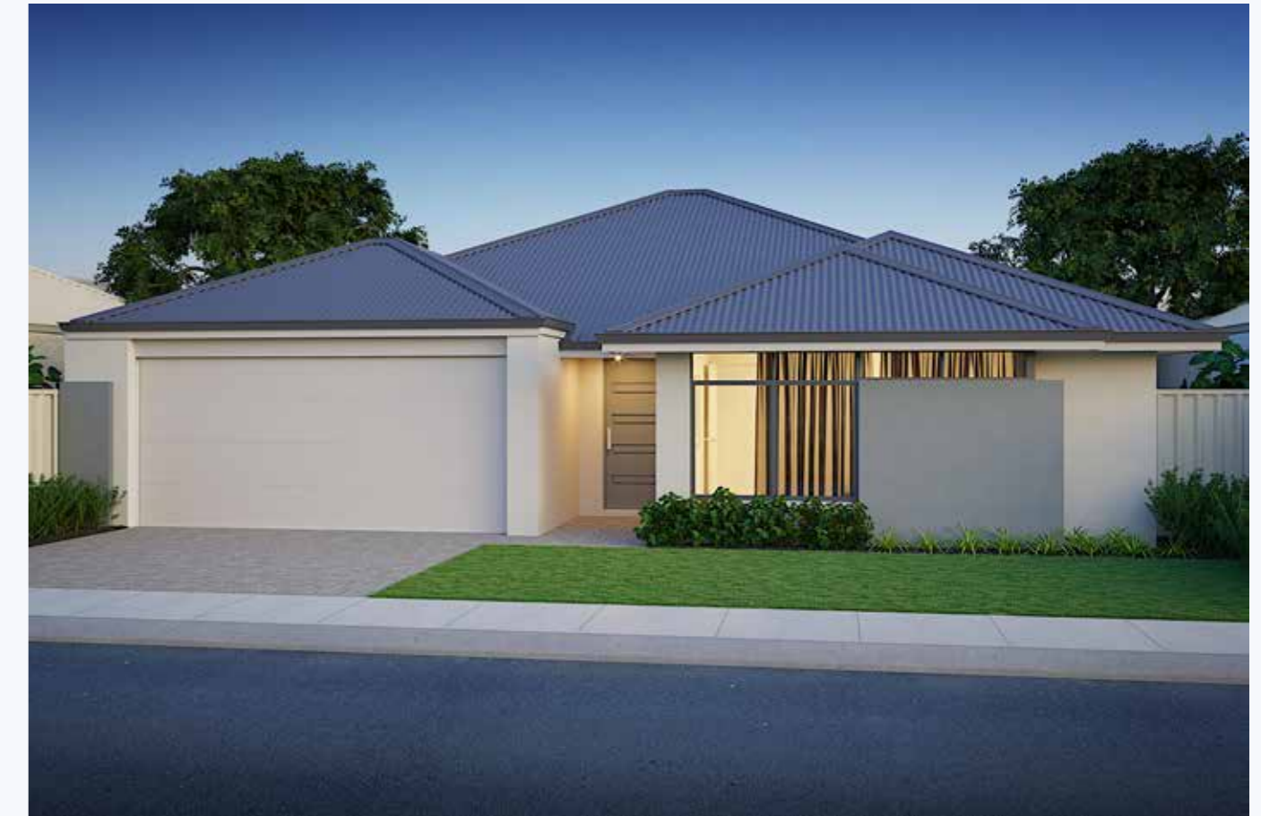
Avalon Beach Included