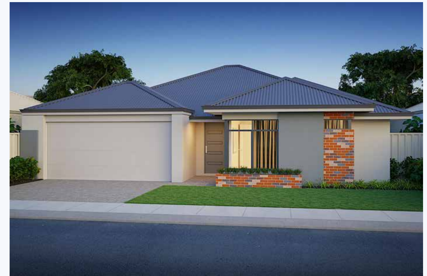
Avalon Beach Premium