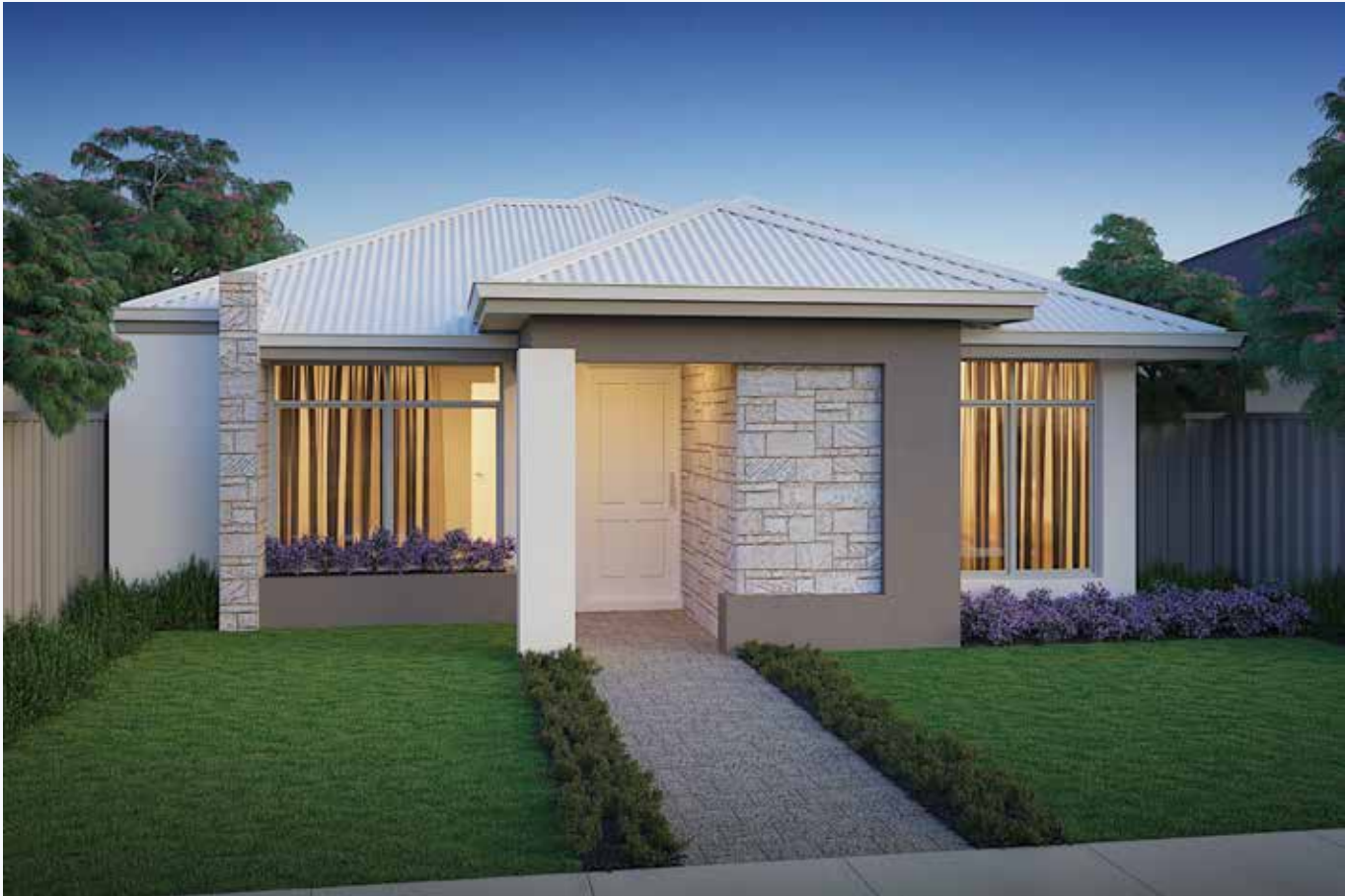
Wineglass Bay Premium