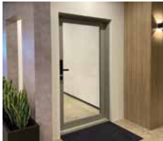
Smart Lock Door