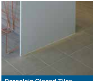
Porcelain Glazed Tiles