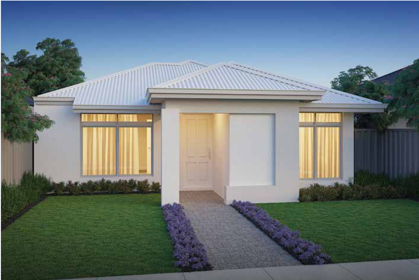
Wineglass Bay Included