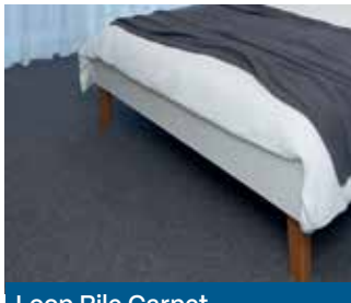
Loop Pile Carpet