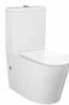
China Toilet Suite with Soft Close Seat