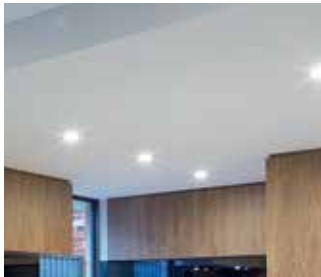
Led Lighting Internally