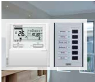
Reverse Cycle Air Con