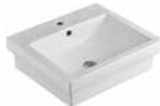
Above Mount China Vanity Basin