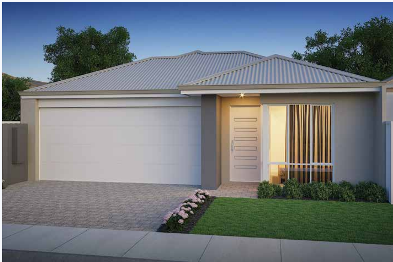
Turquoise Bay Included