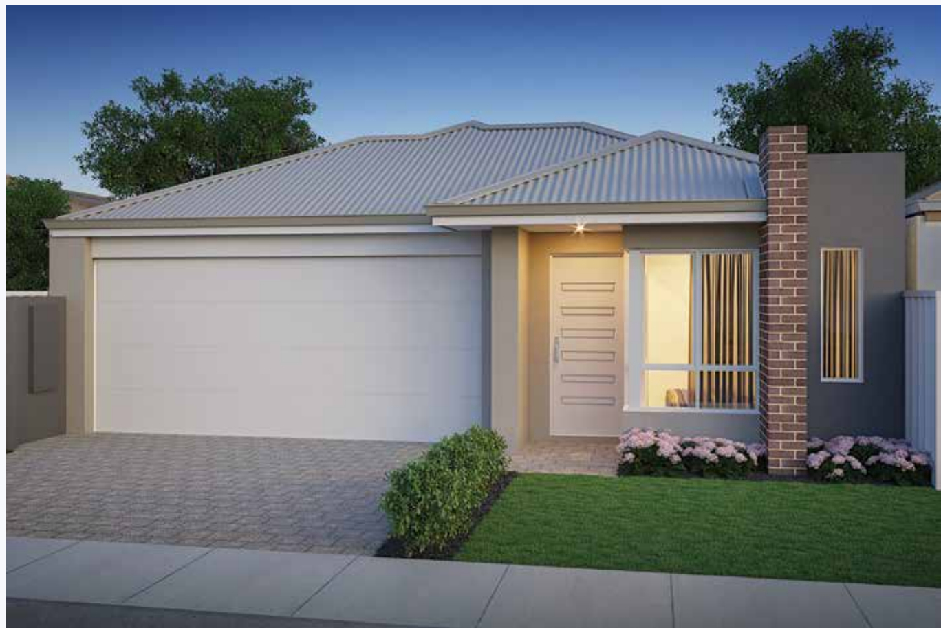
Turquoise Bay Premium