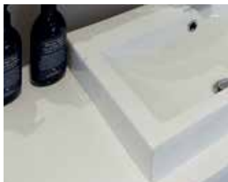
Stone Benchtops Throughout