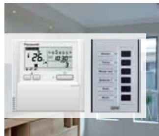
Reverse Cycle Air Con