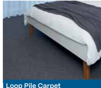
Loop Pile Carpet