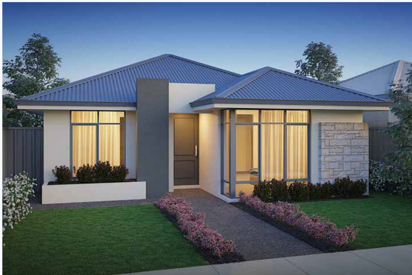
Salmon Bay Premium