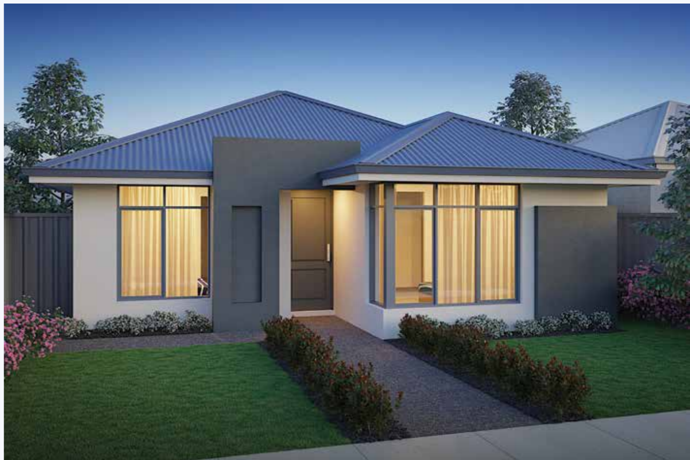
Salmon Bay Included