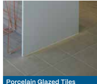
Porcelain Glazed Tiles