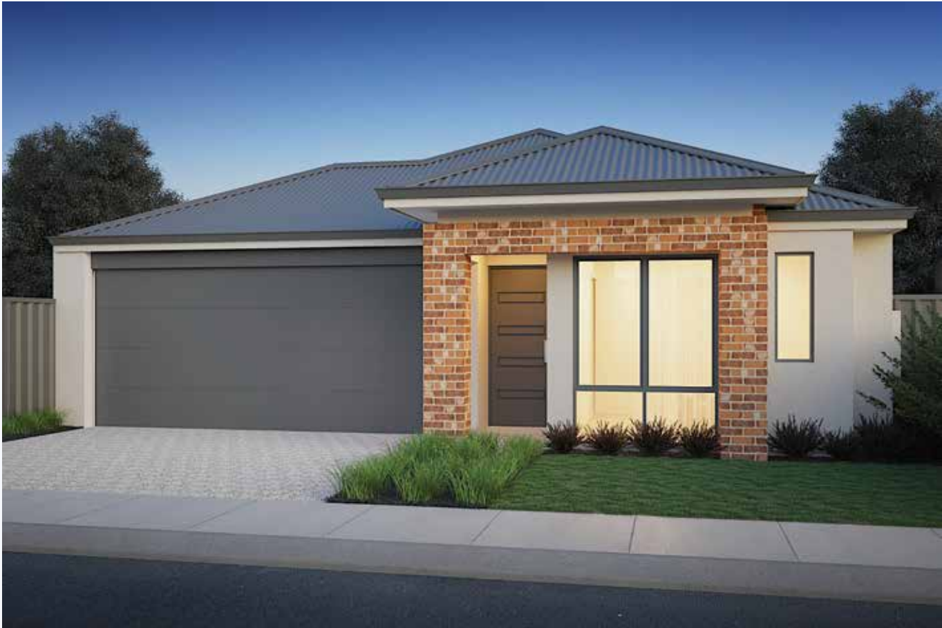
Peppermint Beach Premium