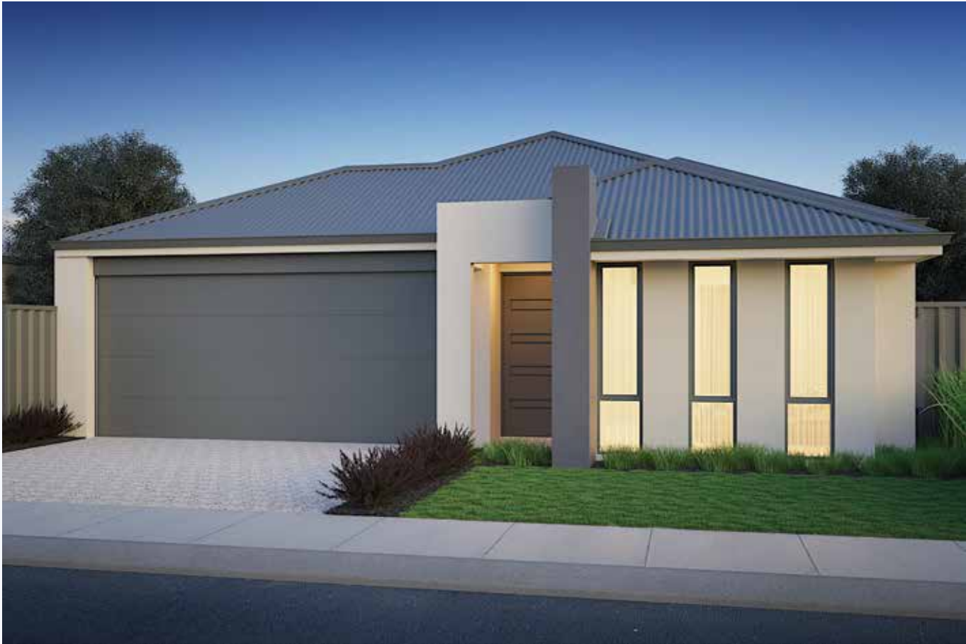
Peppermint Beach Included