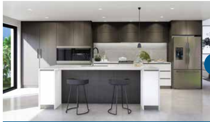
Luxury Kitchen - Galley