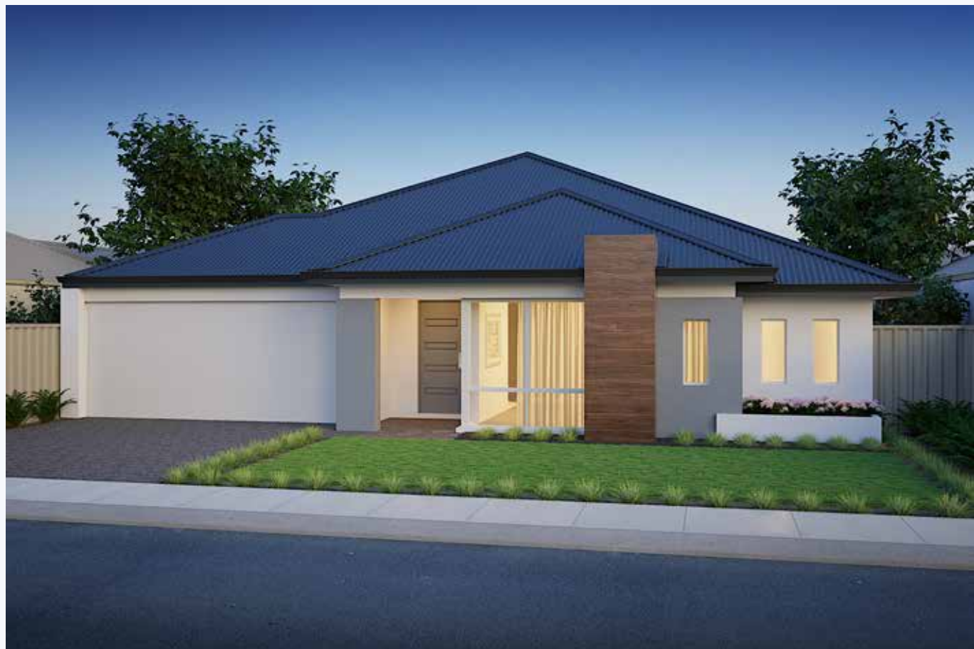
The Manly Premium