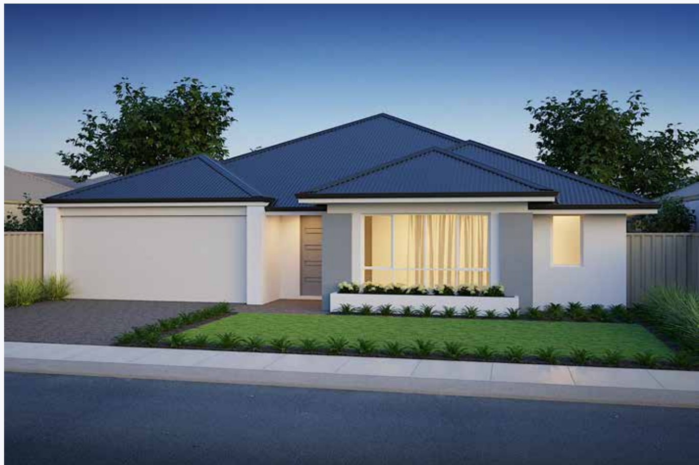
The Manly Included