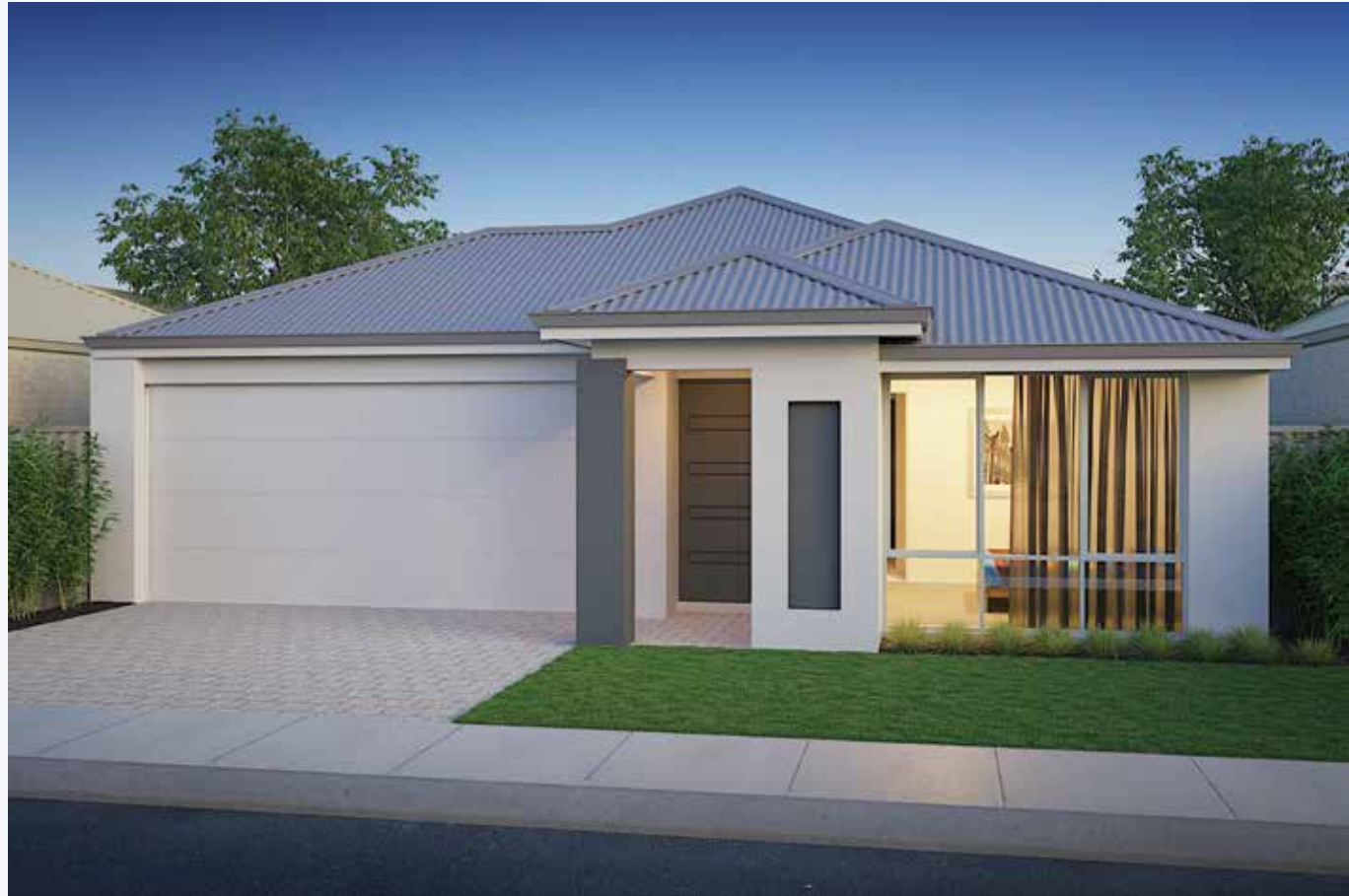
Cable Beach Included