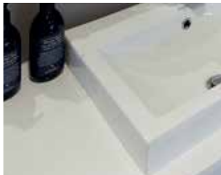
Stone Benchtops Throughout