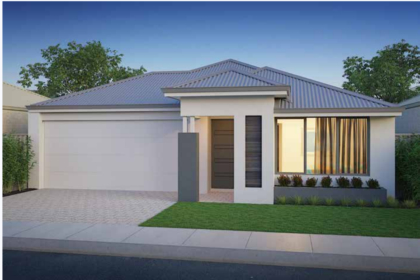
Cable Beach Premium