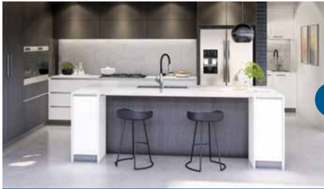
Luxury Kitchen - Corner