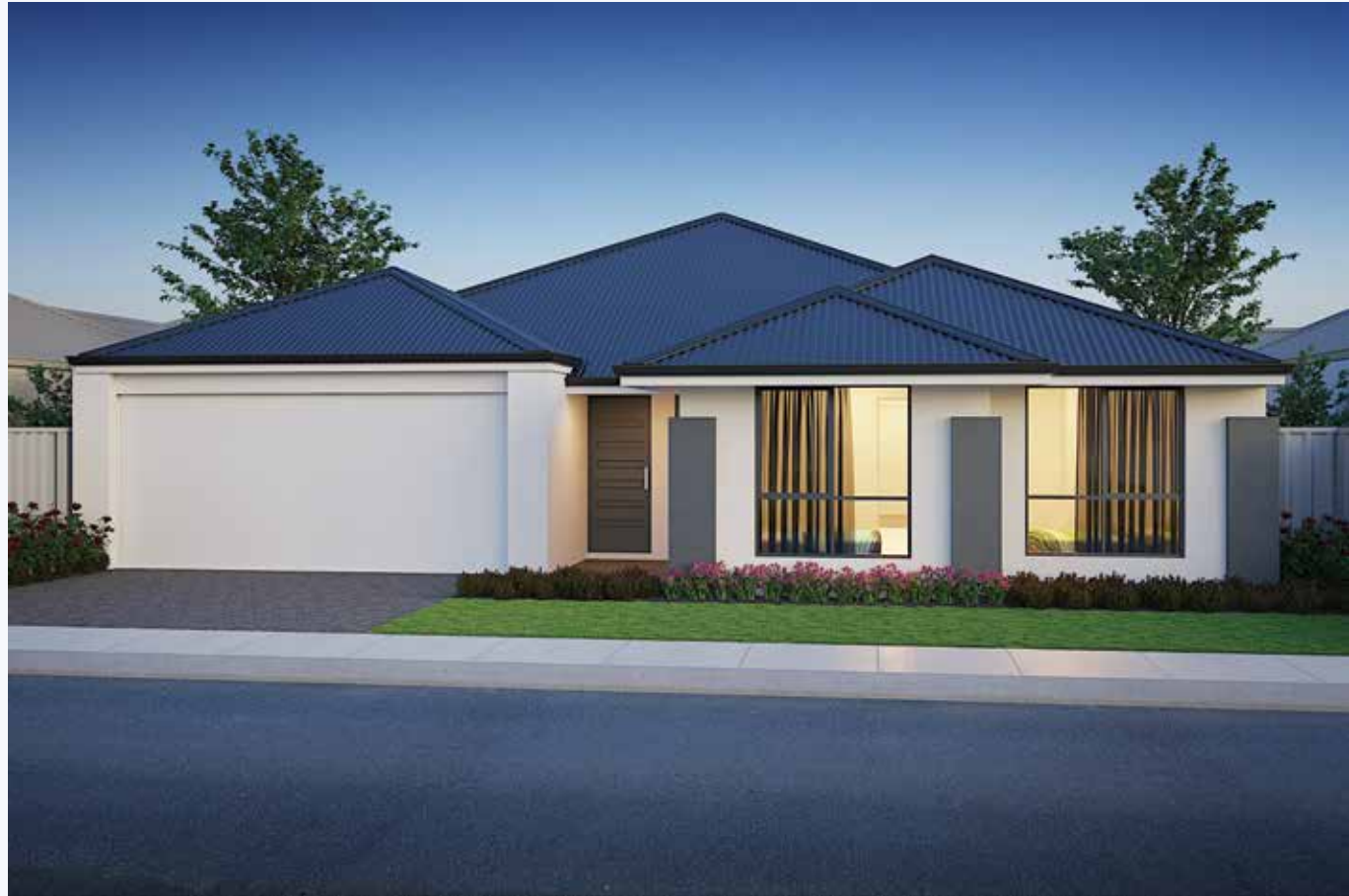
Bronte Beach Included