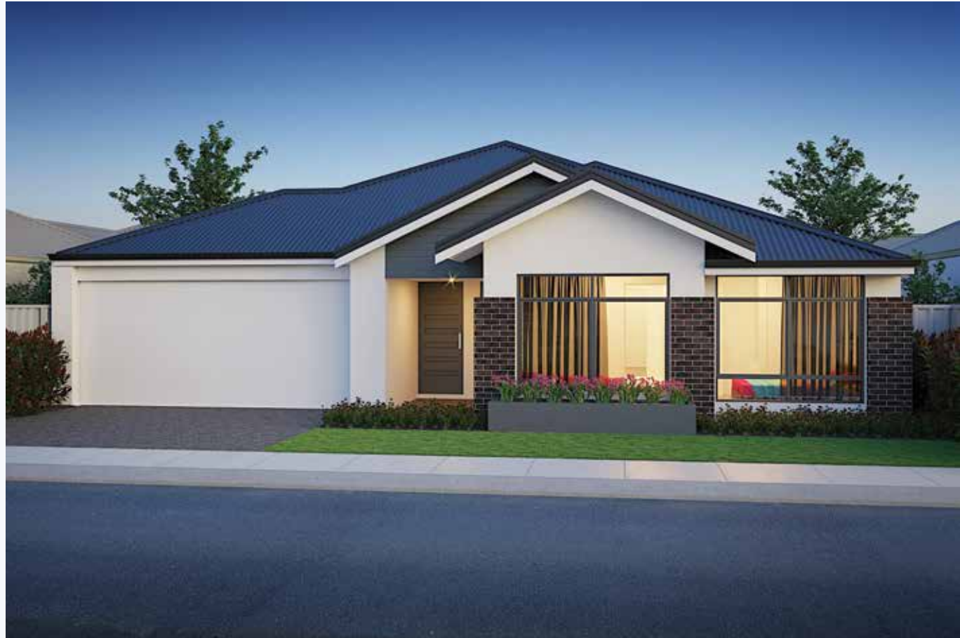
Bronte Beach Premium