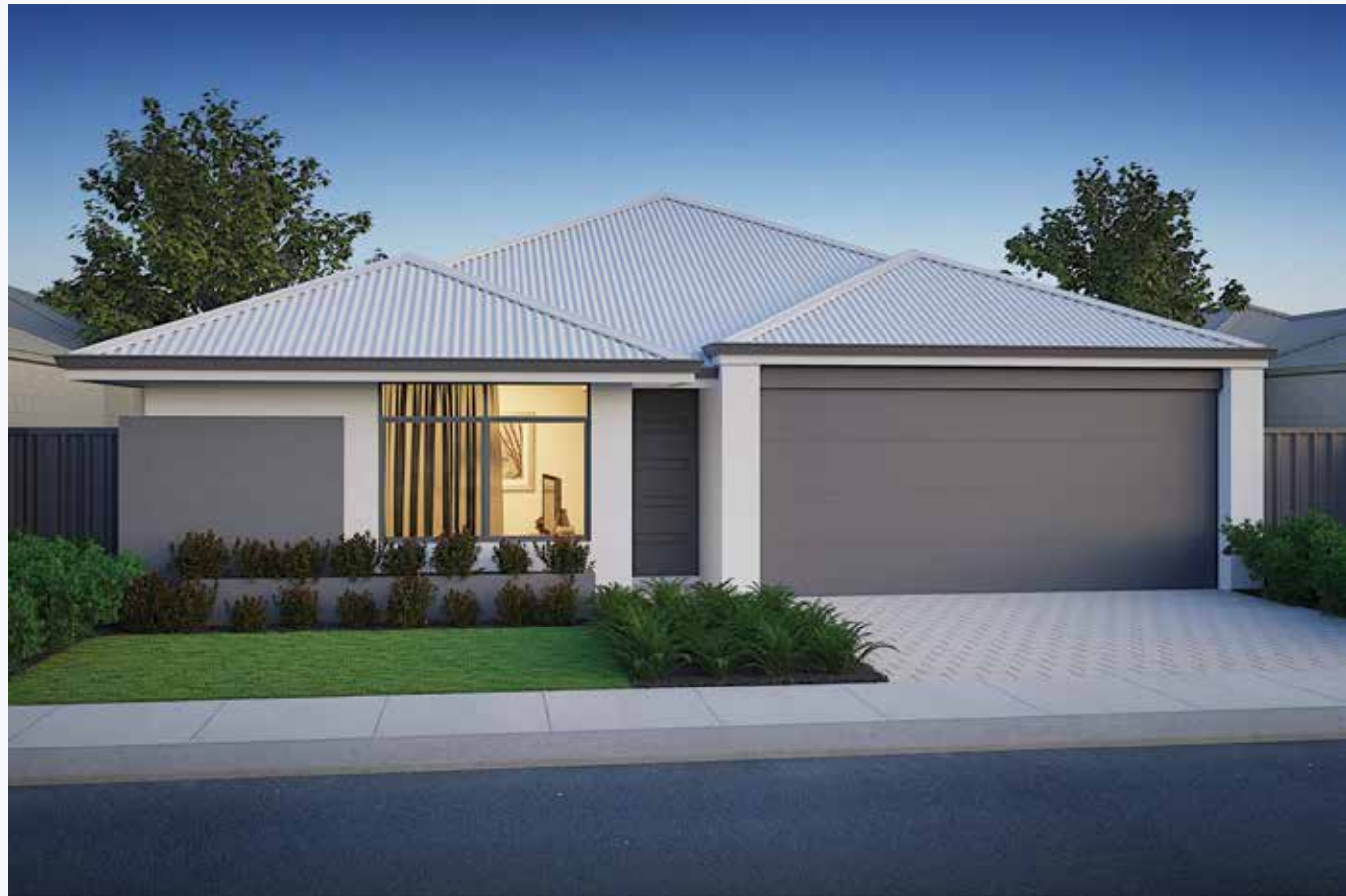
Brighton Beach Included