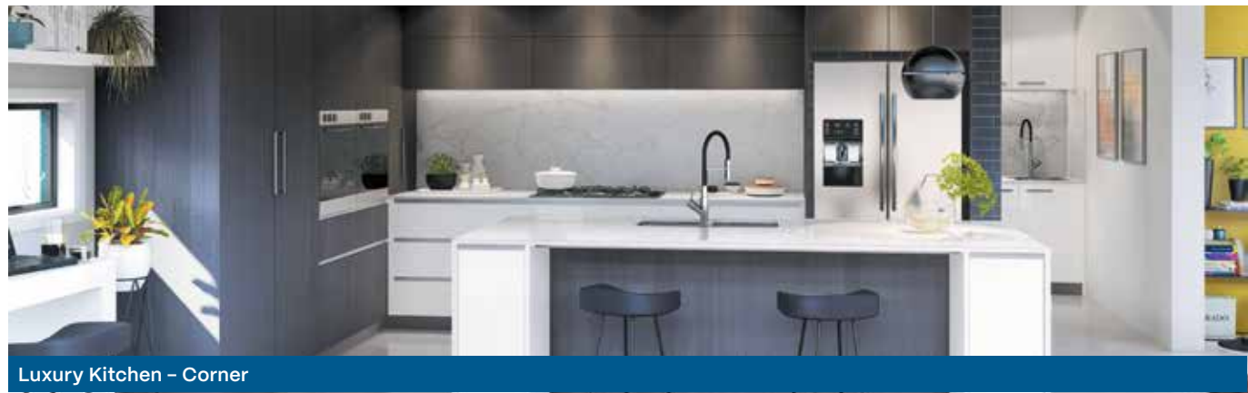
Luxury Kitchen – Corner