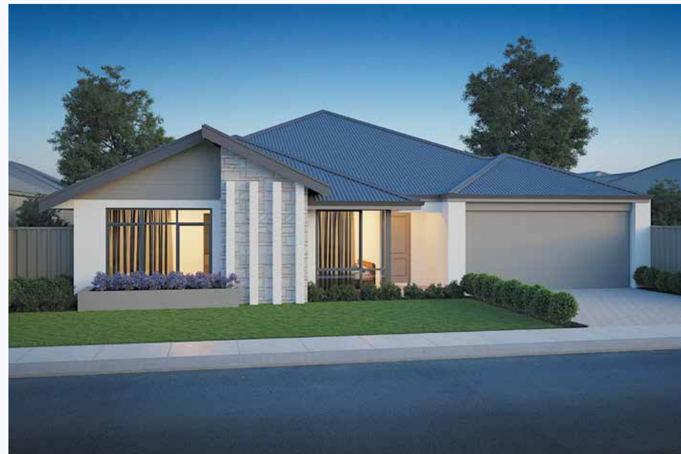
The Bondi Premium