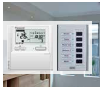
Reverse Cycle Air Con