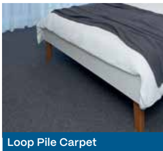
Loop Pile Carpet