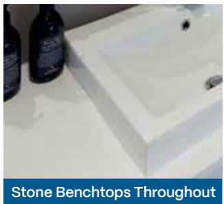
Stone Benchtops Throughout