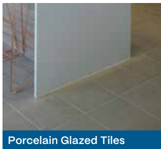
Porcelain Glazed Tiles