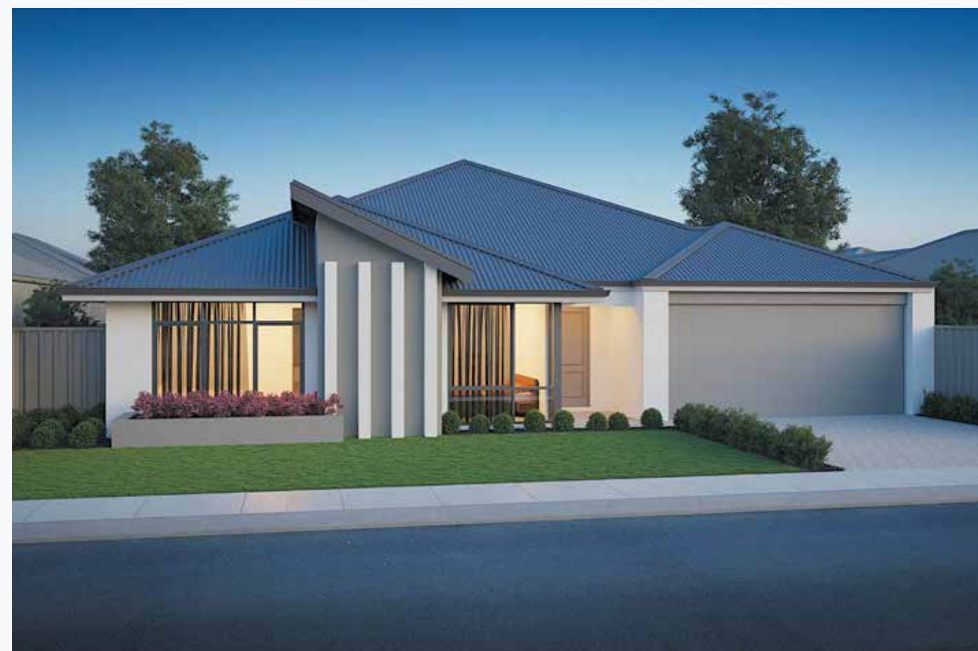
The Bondi Included