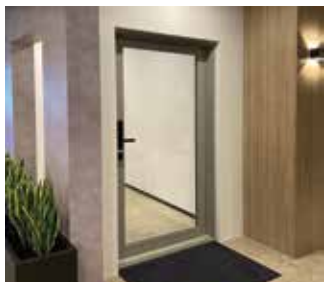
Smart Lock Door