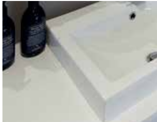
Stone Benchtops Throughout