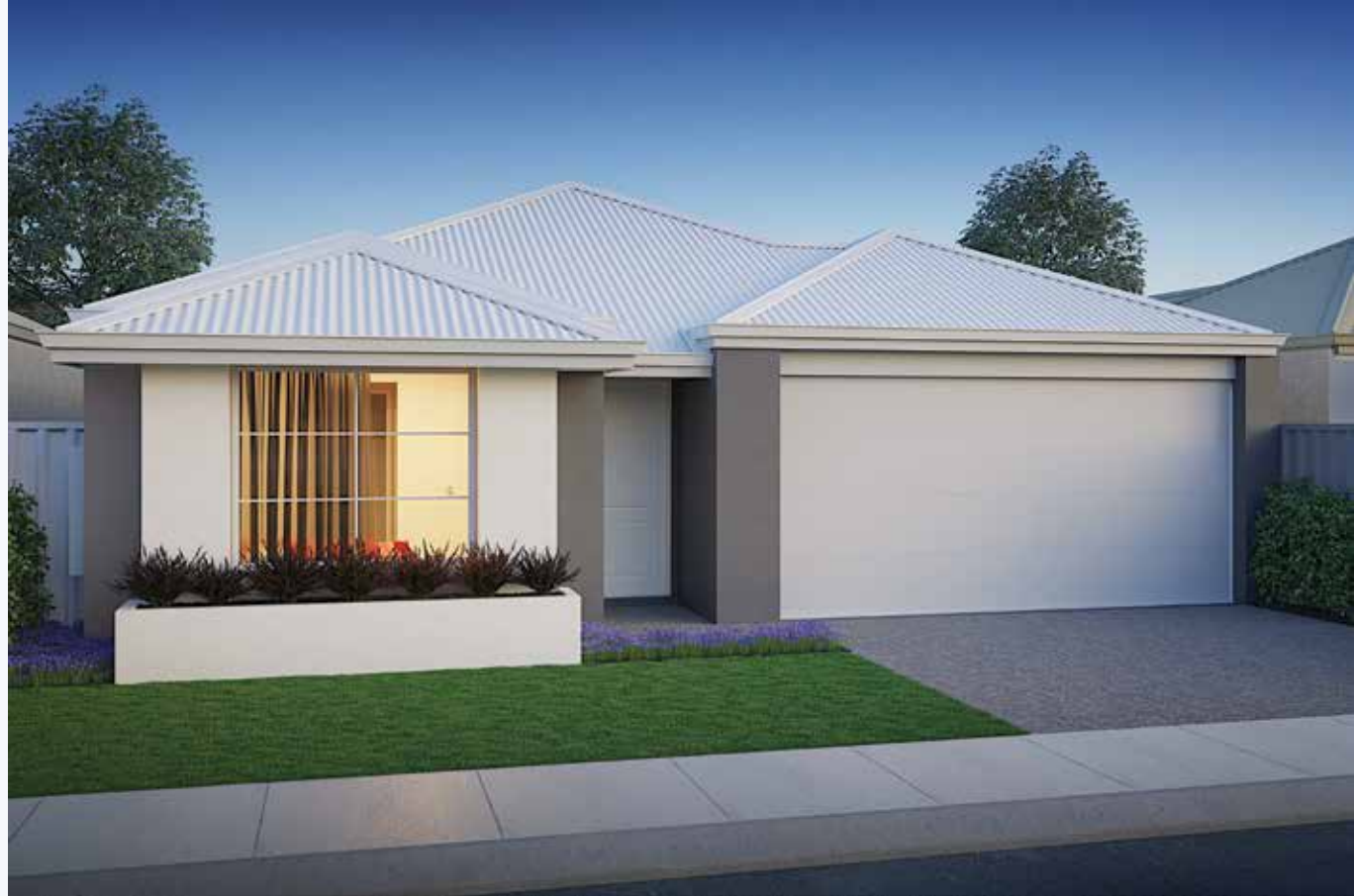
Bells Beach Included