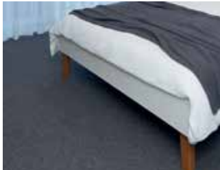
Loop Pile Carpet