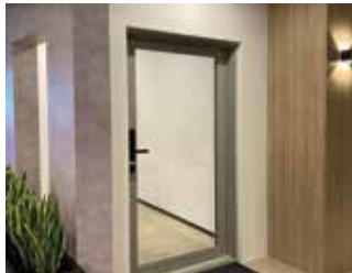
Smart Lock Door