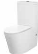
China Toilet Suite with Soft Close Seat