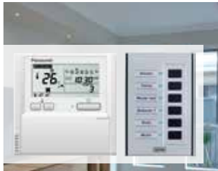
Reverse Cycle Air Con