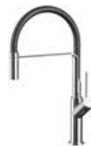
Kitchen Sink Mixer