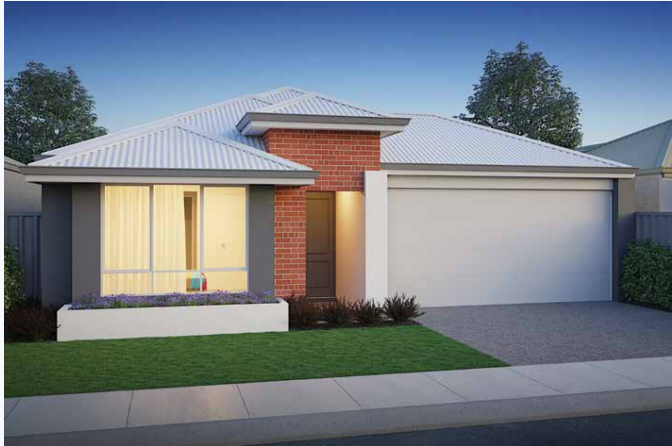
Bells Beach Premium