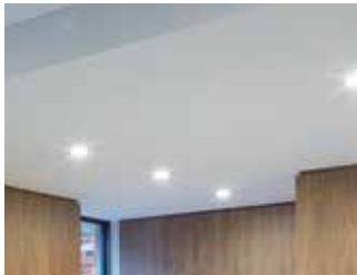
Led Lighting Internally