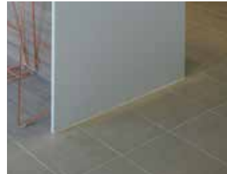
Porcelain Glazed Tiles