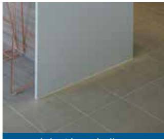
Porcelain Glazed Tiles