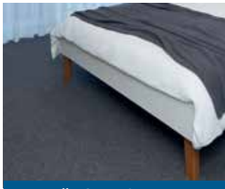
Loop Pile Carpet