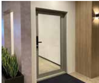
Smart Lock Door