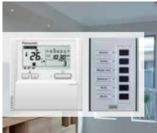
Reverse Cycle Air Con