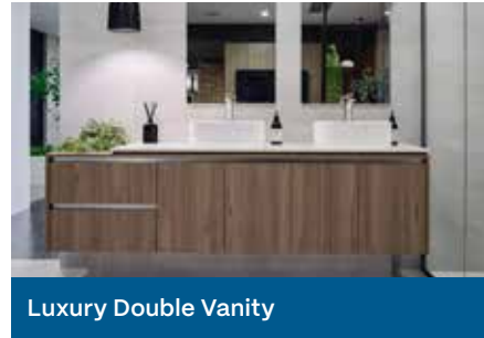
Luxury Double Vanity