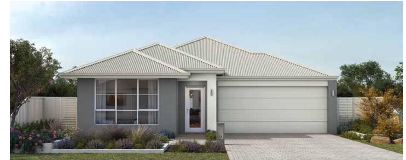
Tuscan Sun Contemporary