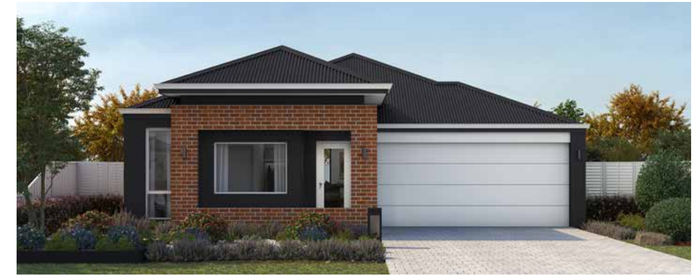
Tuscan Sun Urban