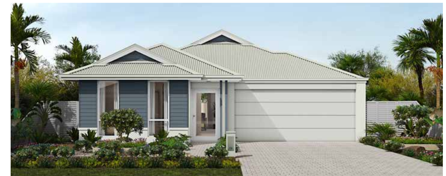
Tuscan Sun Coastal