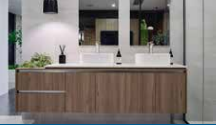
Luxury Double Vanity