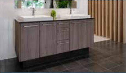
Lifestyle Double Vanity