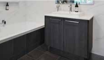
Lifestyle Bathroom / Ensuite