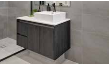
Luxury Single Vanity