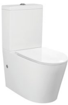
China Toilet Suite with Soft Close Seat