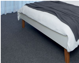
Loop Pile Carpet