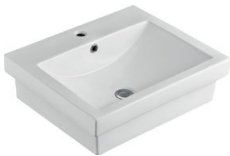
Above Mount China Vanity Basin