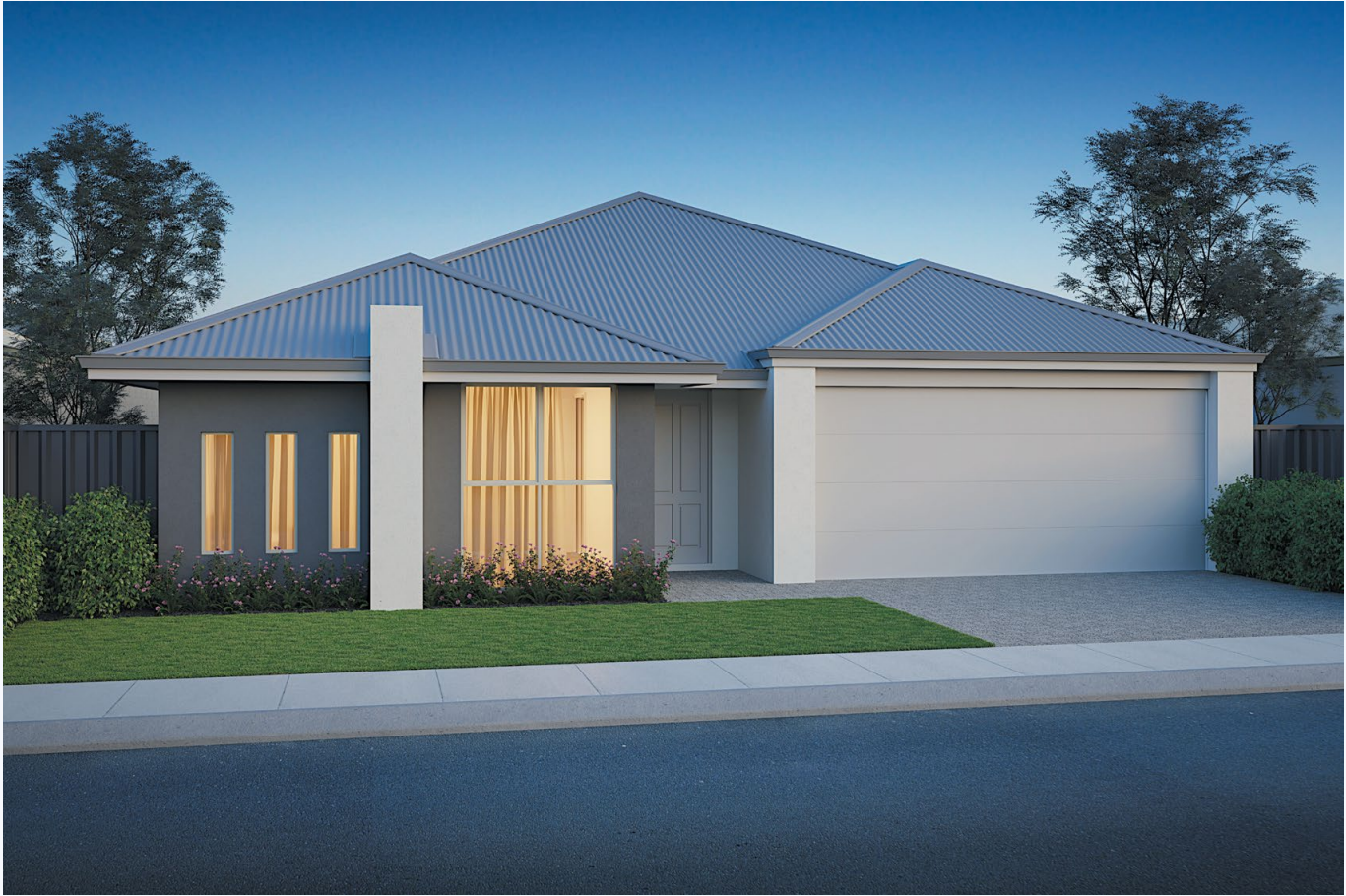
St Kilda Beach Included