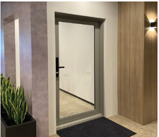
Smart Lock Door