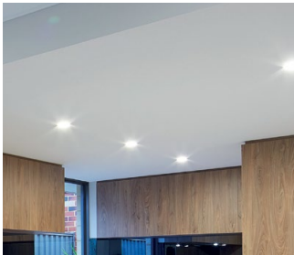
Led Lighting Internally