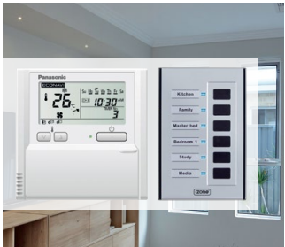
Reverse Cycle Air Con