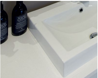
Stone Benchtops Throughout