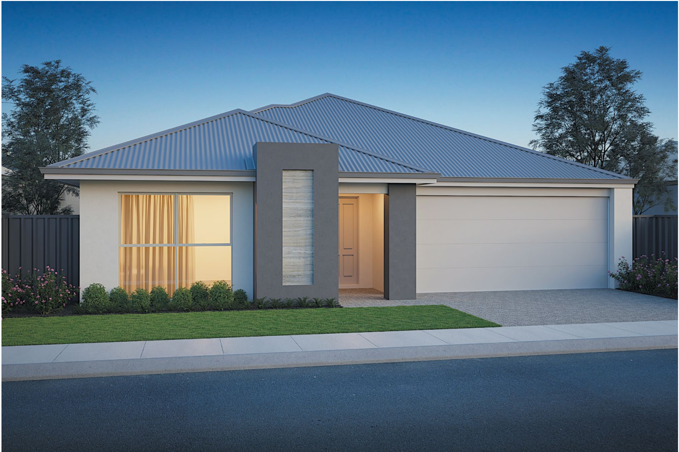
St Kilda Beach Premium