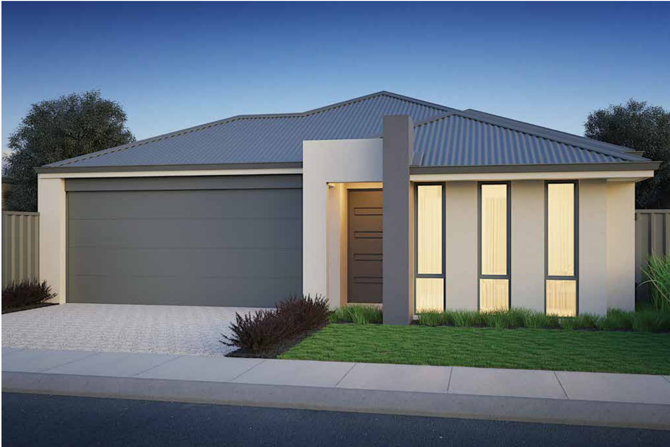
Peppermint Beach Included