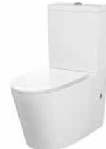
China Toilet Suite with Soft Close Seat