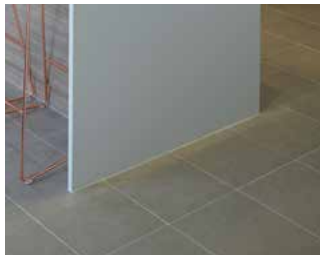
Porcelain Glazed Tiles