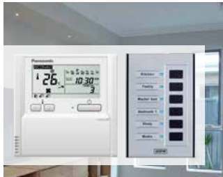
Reverse Cycle Air Con