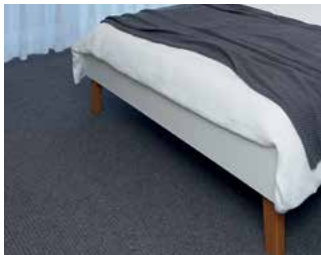
Loop Pile Carpet