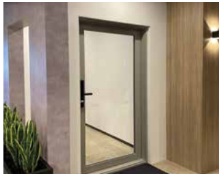
Smart Lock Door