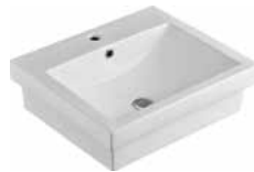
Above Mount China Vanity Basin