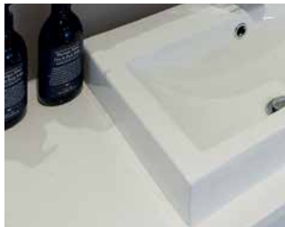
Stone Benchtops Throughout