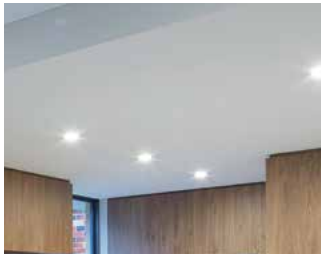
Led Lighting Internally