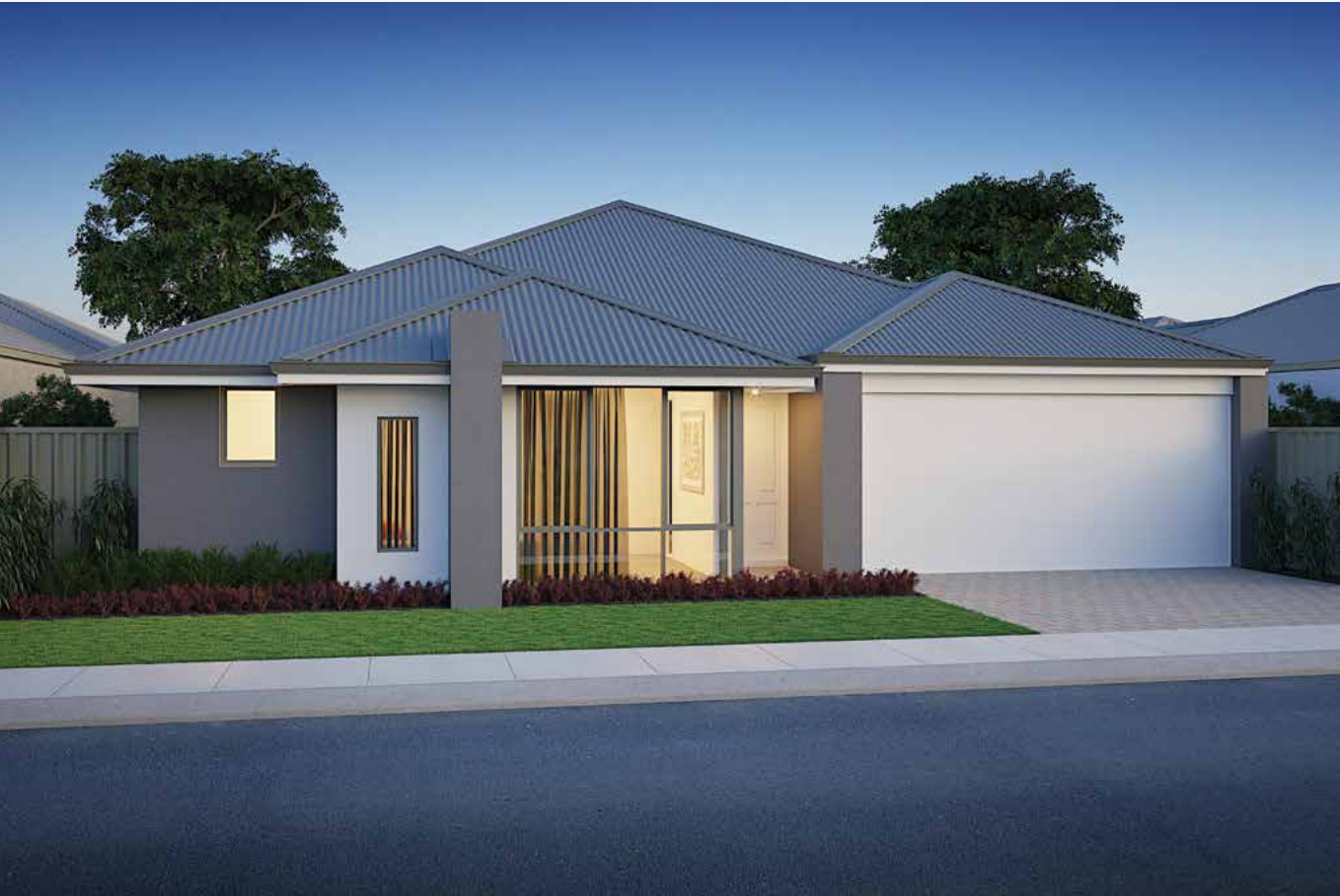
Palm Beach Included