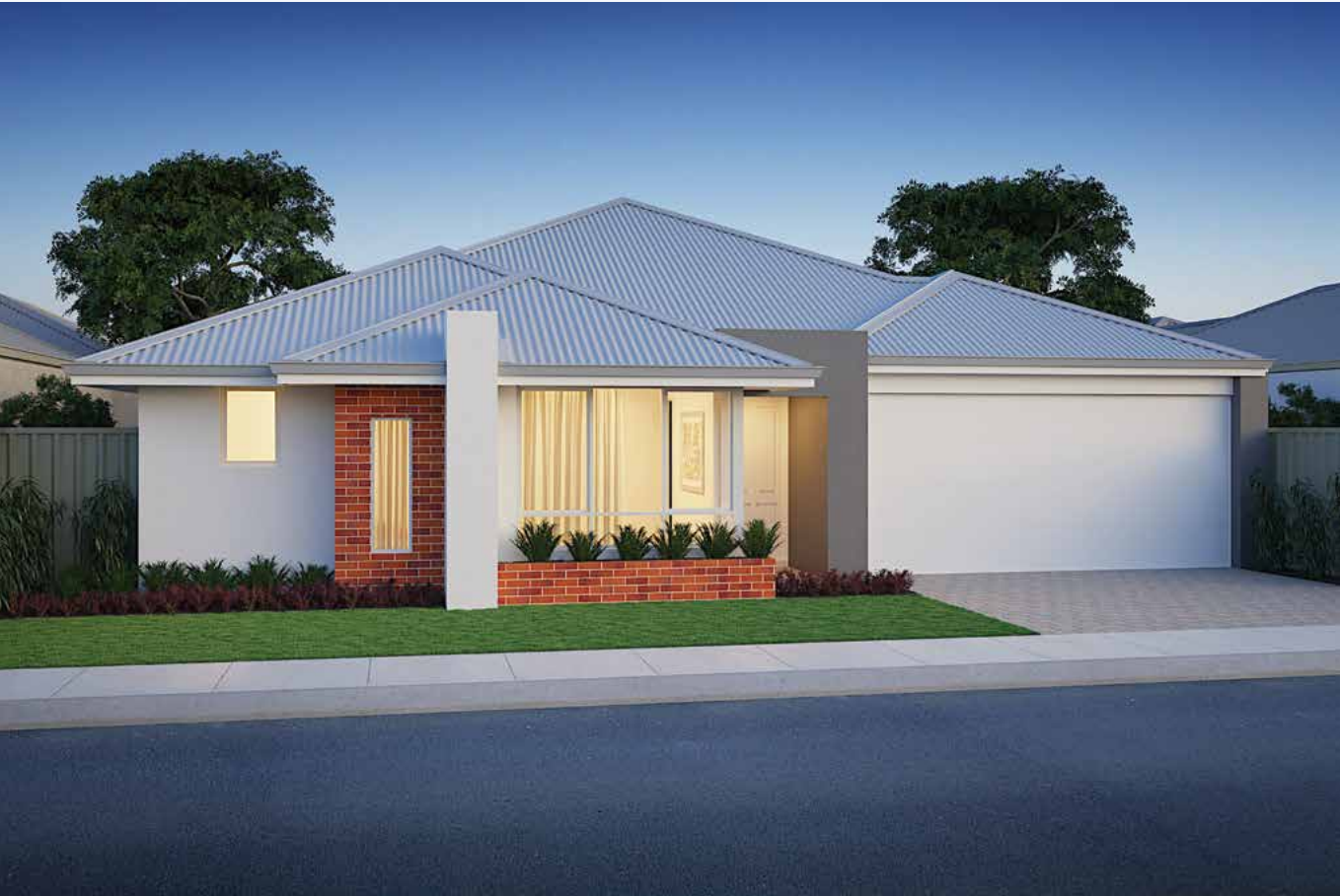
Palm Beach Premium