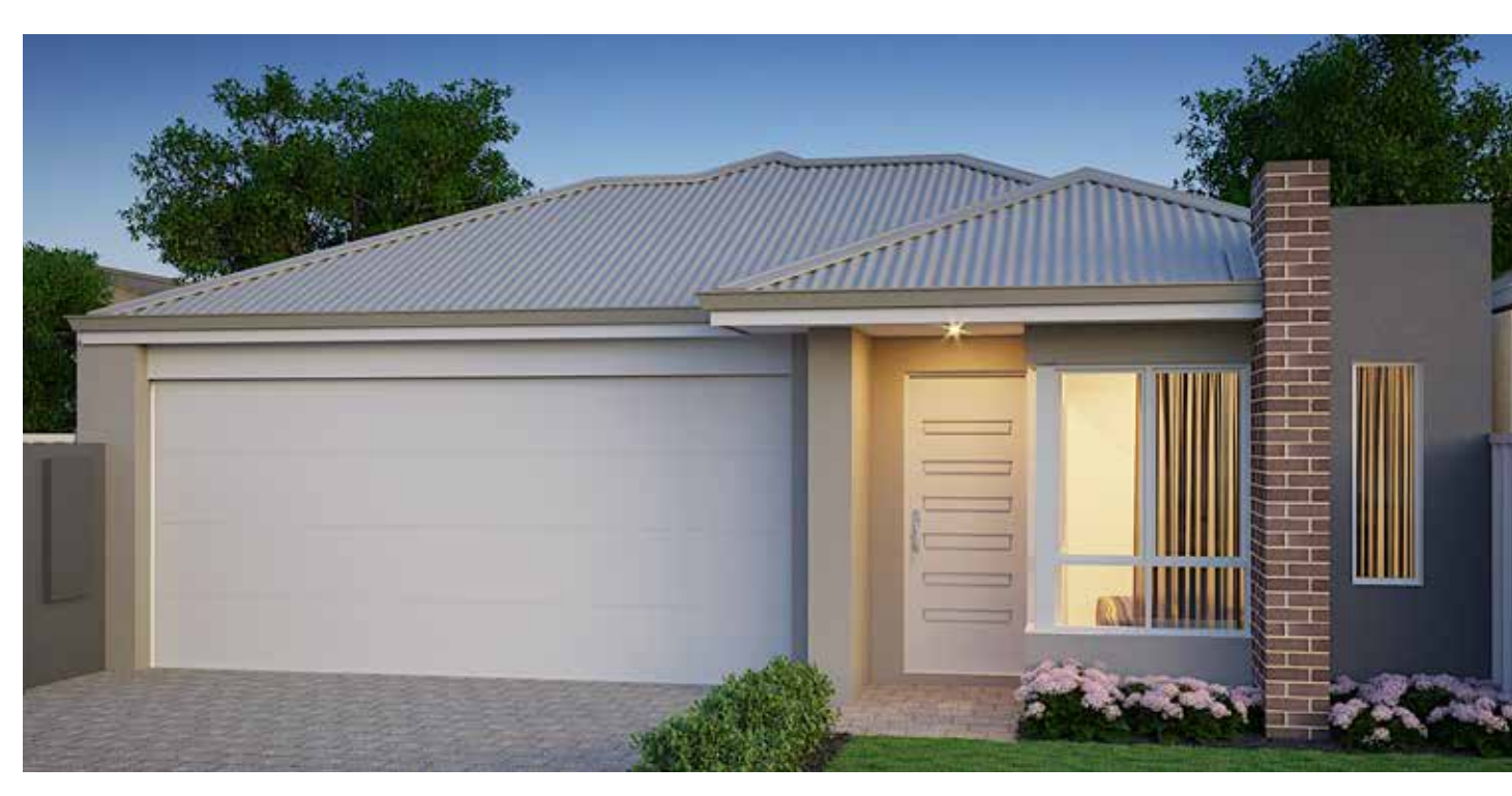
Turquoise Bay Premium