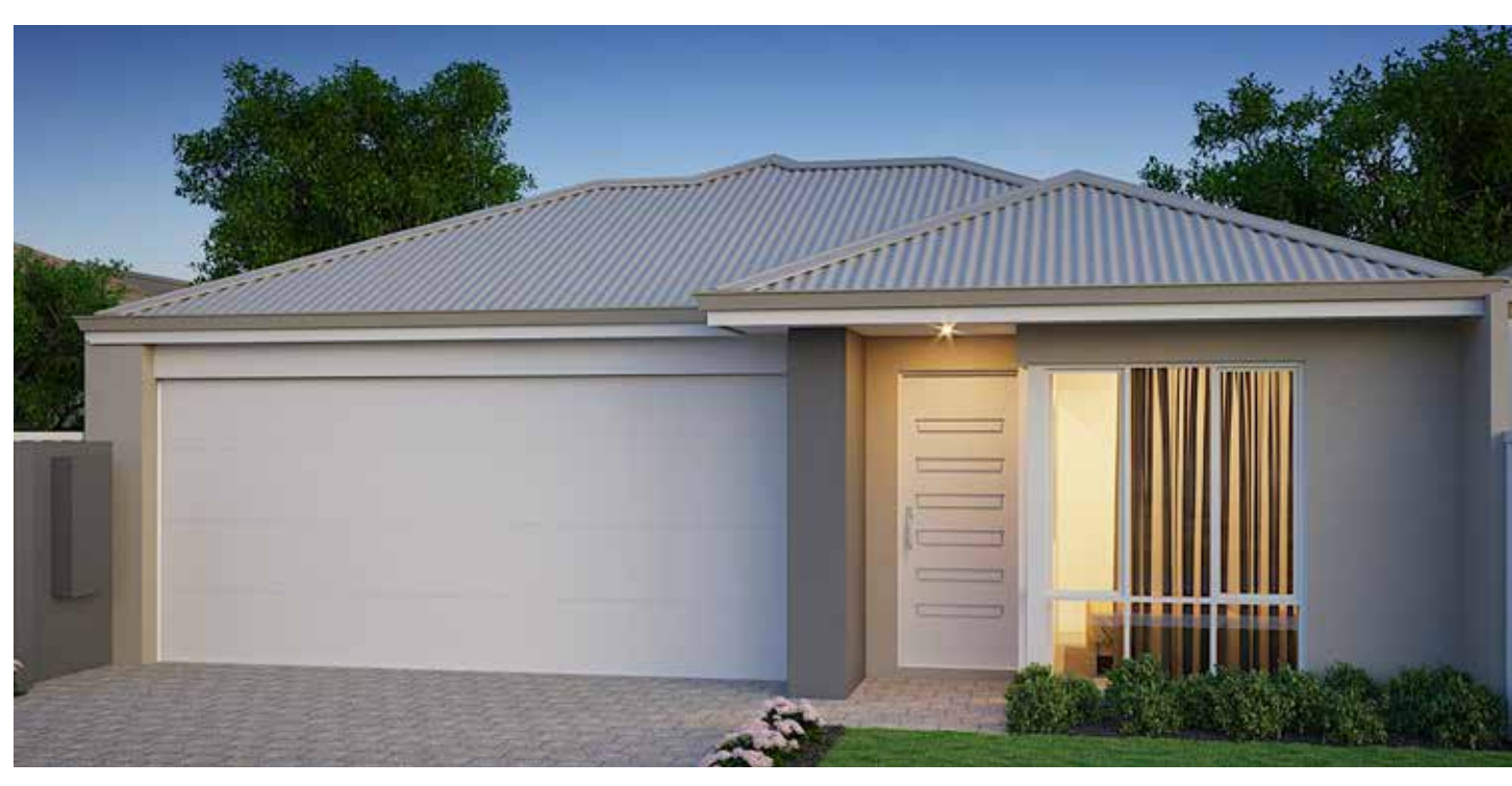
Turquoise Bay Included