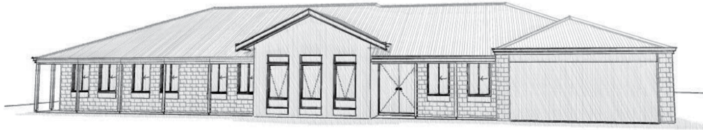
Farm Beach Included

VITAL STATS | Living area 247m 2 (including Alfresco) | Total area 300m 2 (excluding eaves) | Scale 1:100