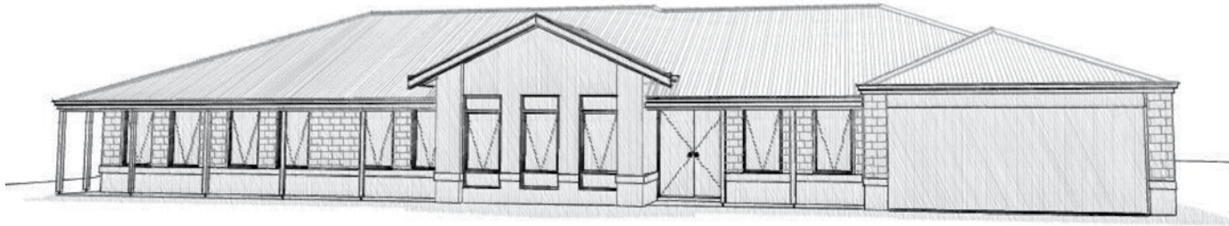
Farm Beach Premium