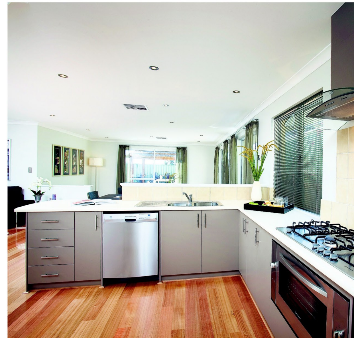
The kitchen has a big corner pantry, fridge recess, underbench microwave and dishwasher recesses and a capped upstand.

from the double garage. A low capped wall between the family room and games room helps define each space, and a glazed door at the back of the games room opens to the garden.