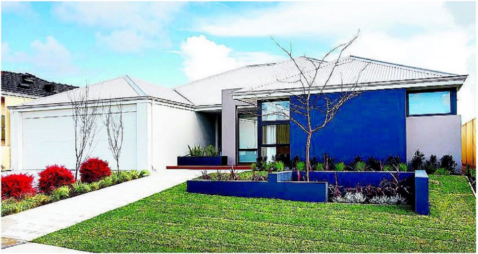
Blueprint Homes' Platinum Mk2 has a contemporary elevation.