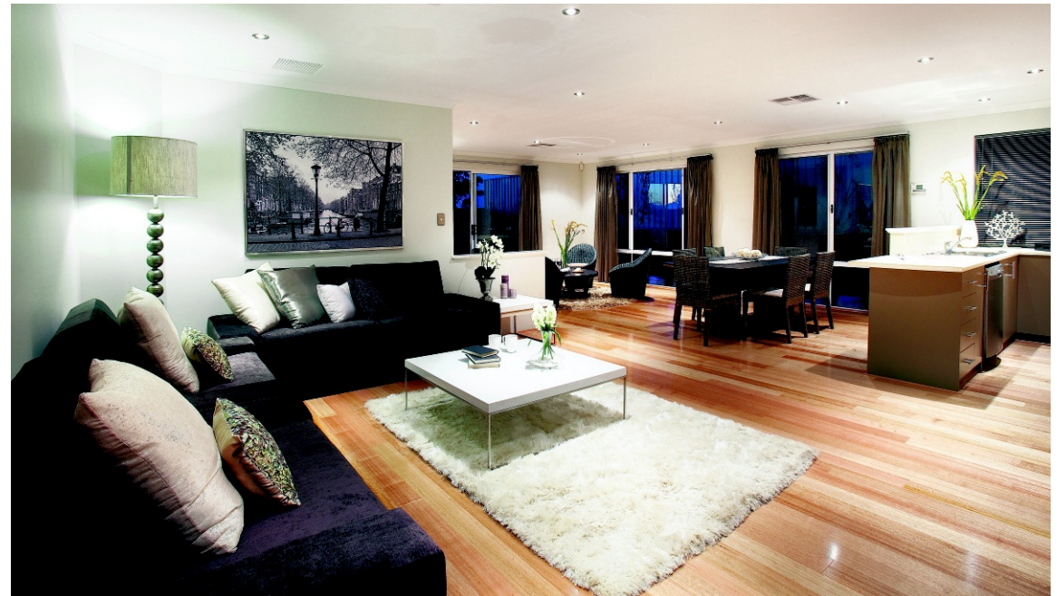
The four-bedroom Montebello's open-plan casual zone is designed on a grand scale, including a central family room.

sleeping area, brightened by the feature window of the facade, with a deep walk-in robe and an open ensuite with squareform benchtops on the vanity, enclosed shower and separate toilet.