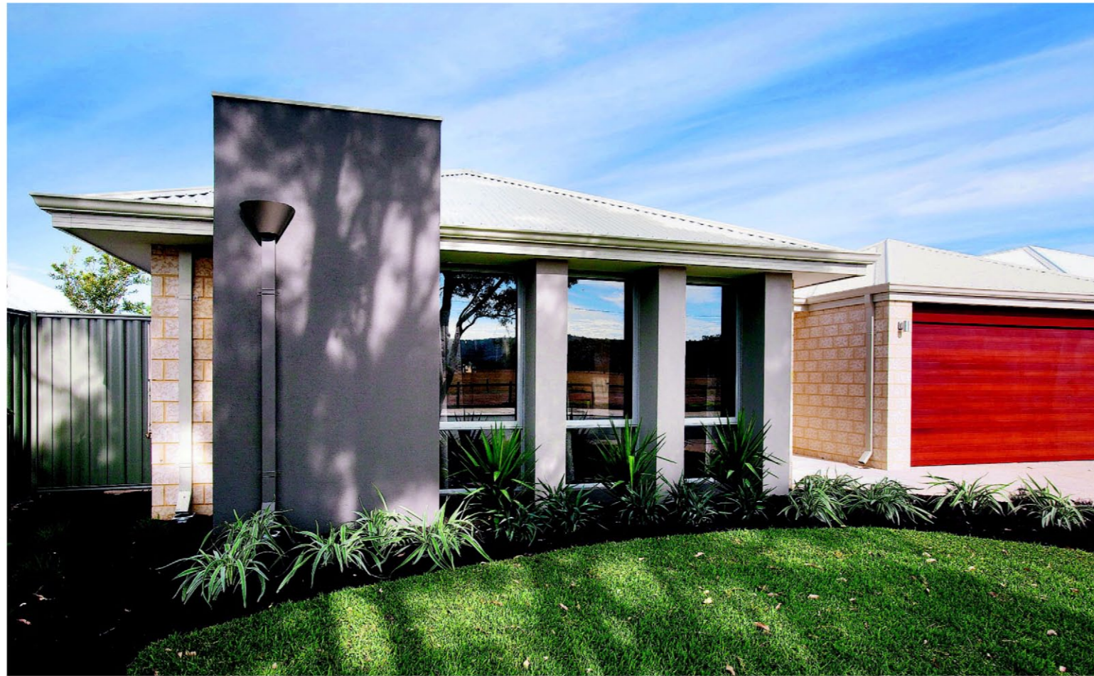
The full-height windows allow plenty of light into the main bedroom at the front of the Colorado in Byford.

The compact Colorado was designed to appeal to first-time buyers. Ingrid Waltham reports.