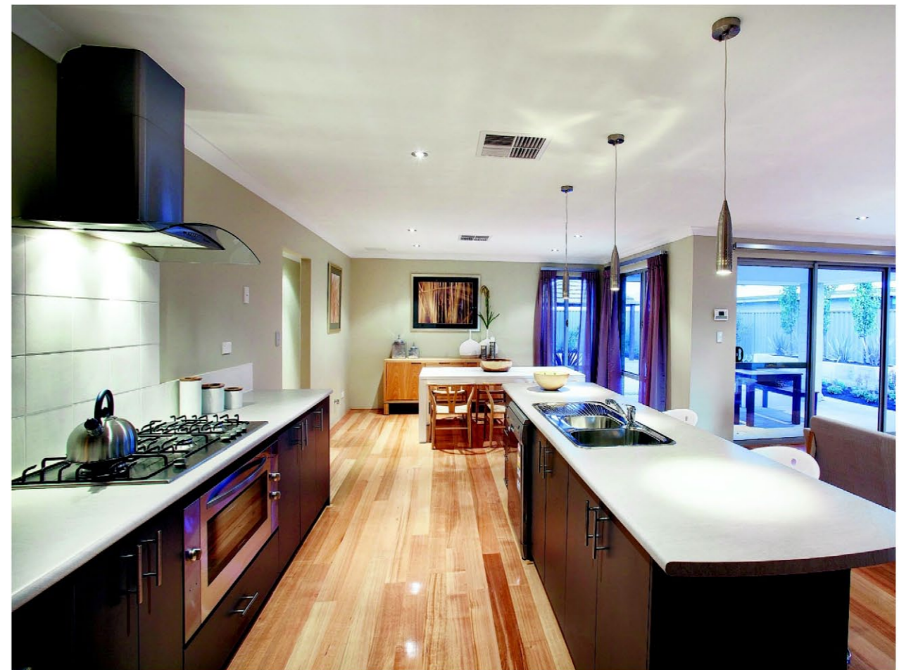
From the kitchen, the cook can still keep an eye on the meals area and the alfresco area.