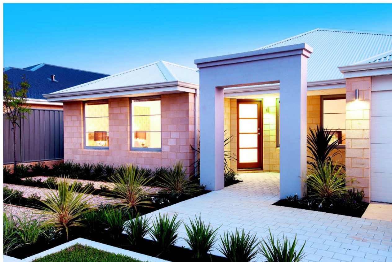
A broad veranda shelters the front door, which is set at a 45-degree angle and opens to a compact entry in the Nevona.